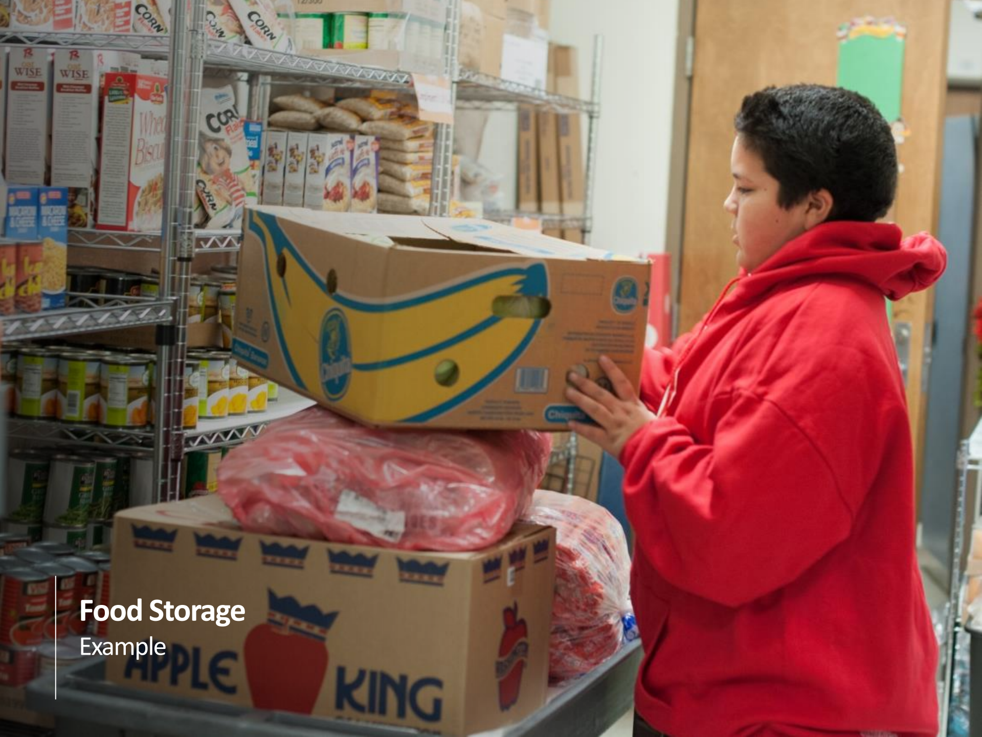
Food Storage Example