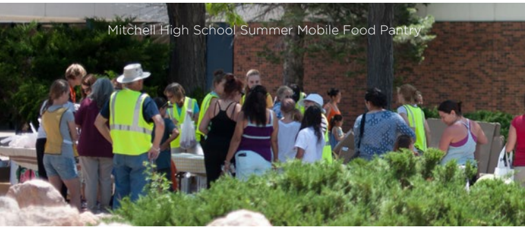
Mitchell High School Summer Mobile Food Pantry